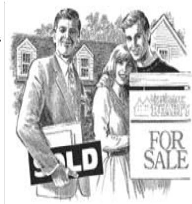
A look at real estate trends in 2011.

State - According to the Indiana Association of Realtors, Inc., January 23, 2012 Press Release, "Statewide, there were 220 more homes sold in 2011 than in 2010. The median price of all 57,985 homes sold in Indiana last